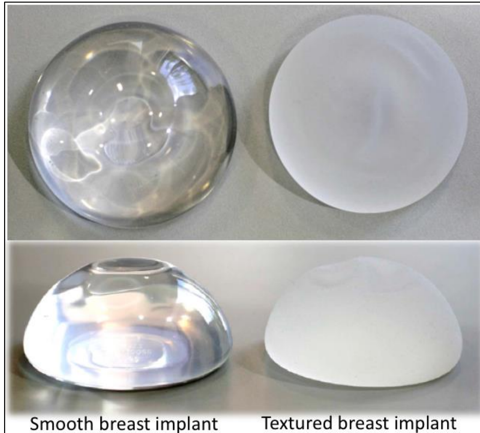
FIGURE 2: BREAST IMPLANT CLASSIFICATION IN ACCORDANCE TO THE OUTER-SHELL SURFACE: SMOOTH (LEFT) AND TEXTURED (RIGHT).

The rationale behind texturing the outer surface of breast implant is to reduce the risk of capsular contracture (encapsulation of the implant by the body), through which the rough surface creates irregular surface to disrupt planar arrangement of cells in contact of the implant. [3] Also, it is believed that the integration between the body tissue and the pores can reduce the implant movement and rotation, as clarified in table 1.